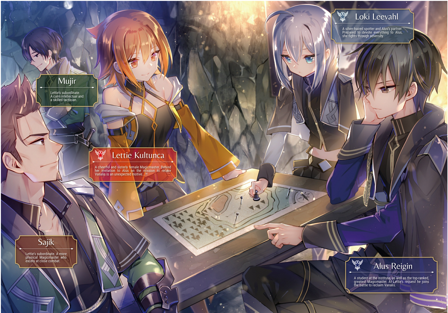
Mujir Lettie's subordinate. A calm intellectual and a skilled tactician.